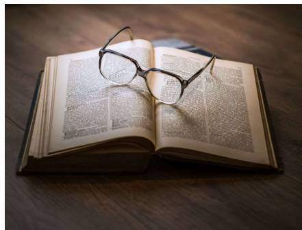
Wife's Submission by Wilburta Arrowood

Bible knowledge is not something commanded to men only. Women also have a duty to grow in the knowledge of our Lord and Savior to the edification of the Body of Christ and self. I have been encouraged by various works that are geared towards helping women do just that. If you are looking for something to help you increase your knowledge, check into the following specifically designed for women: Digging Deep In God's Word group on Facebook or at https://thecolleyhouse.org/ ; Come Fill Your Cup ( http://comefillyourcup.com/ ) and Choosing That Good Part Retreat group on Facebook.